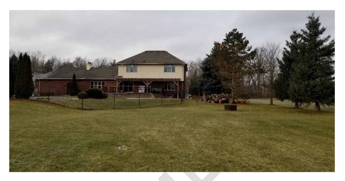
North side yard showing main front entrance