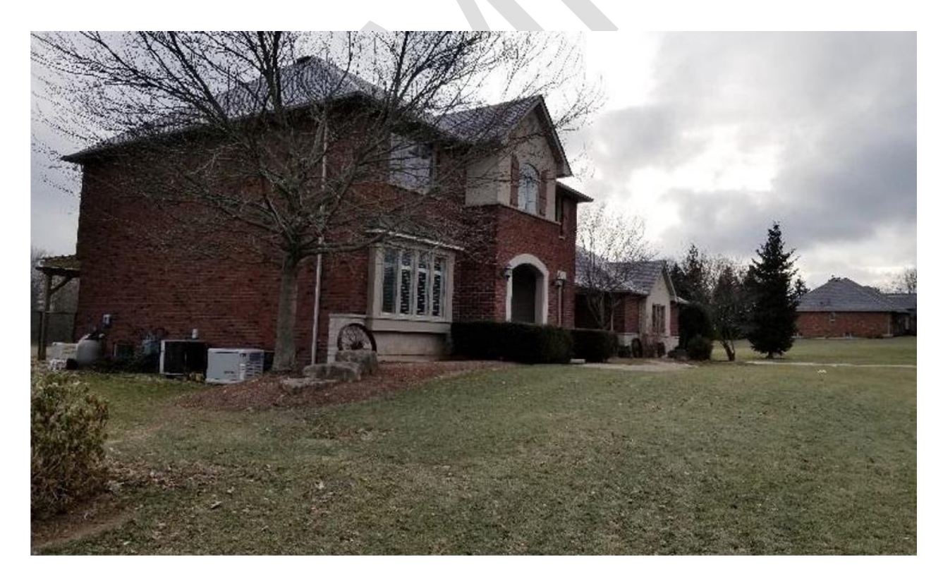
North side yard