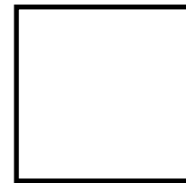
1" x 1"