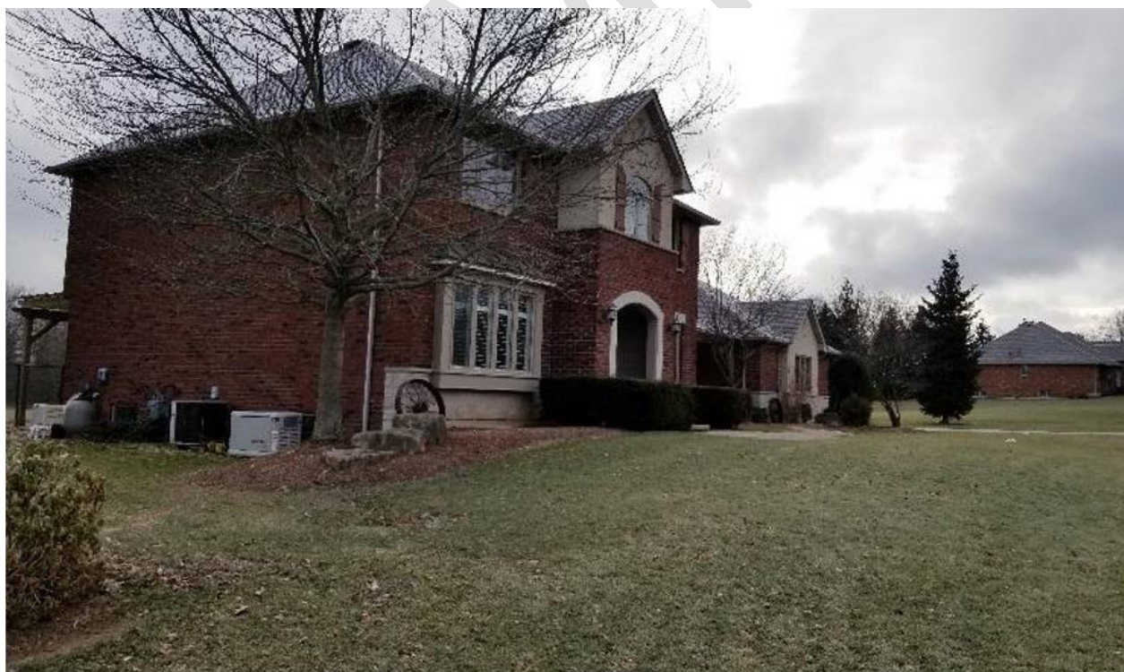
North side yard