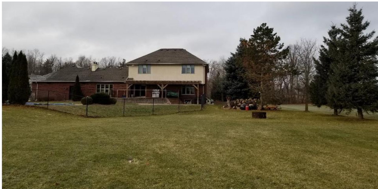
North side yard showing main front entrance